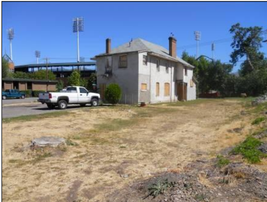
Looking northeast to subject property