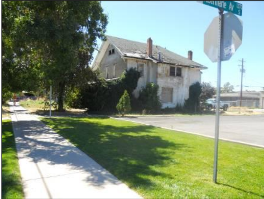
Looking south along S. West Temple to subject property